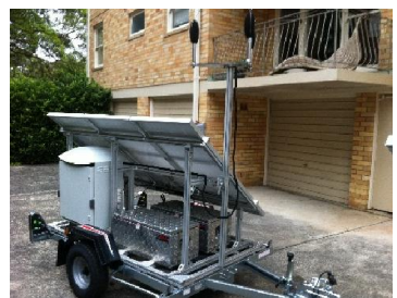
Custom Built Trailer Mounted Unit